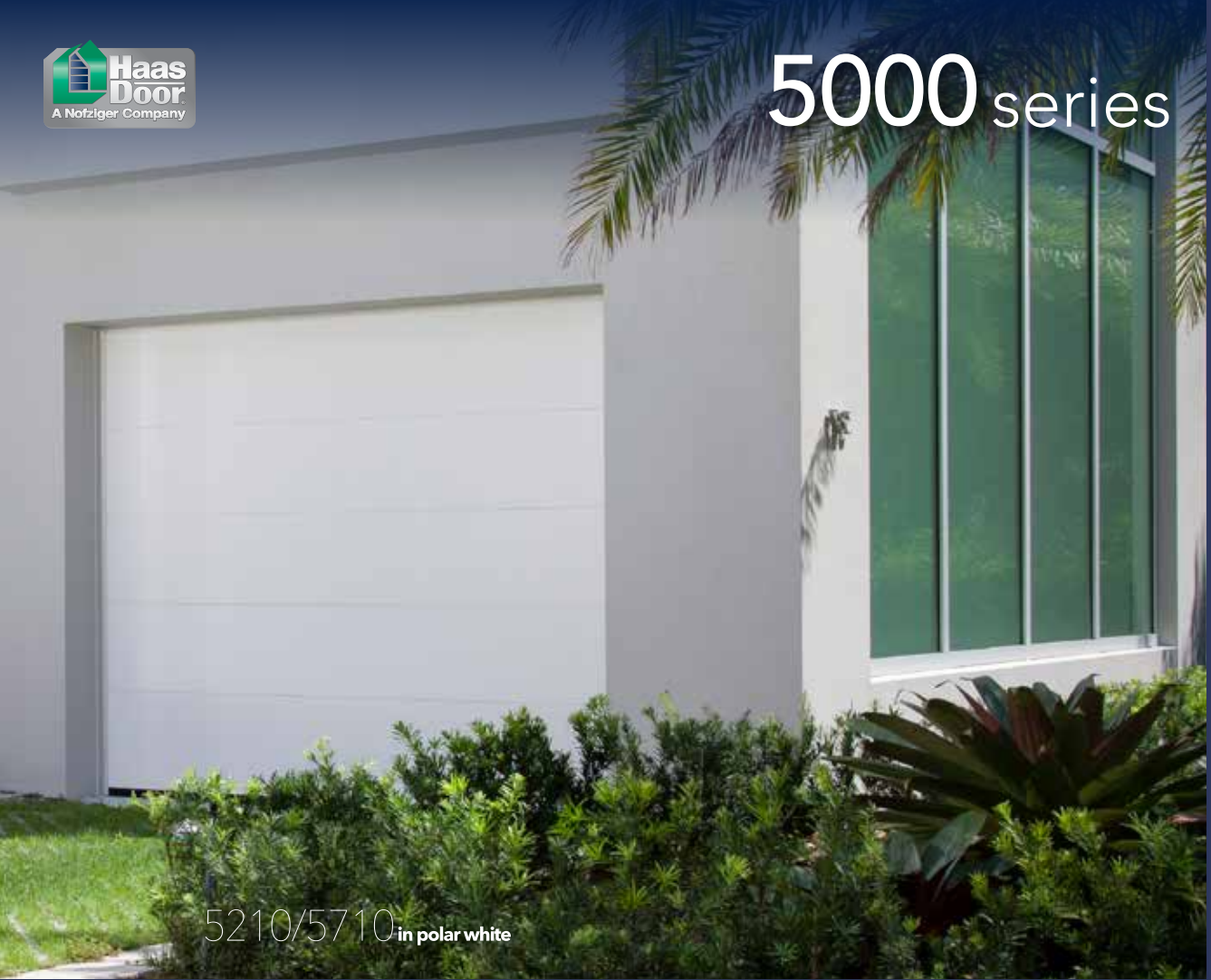
5210/5710 in polar white