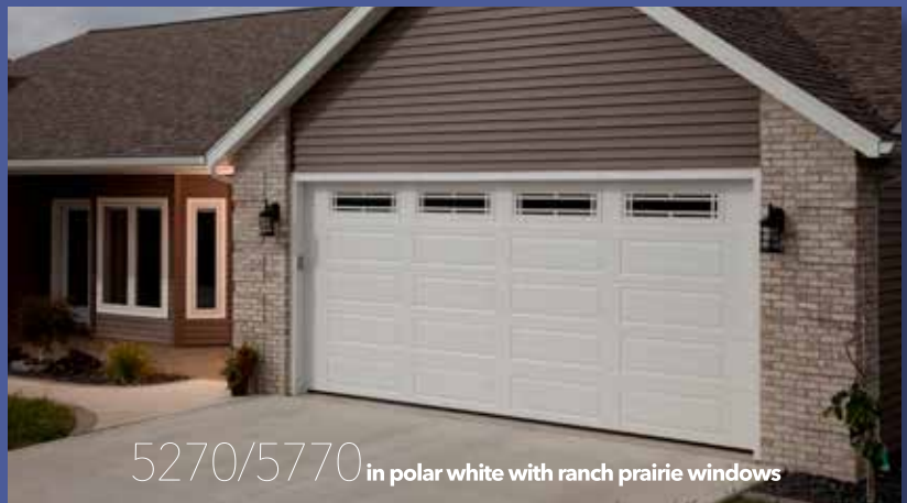
5270/5770 in polar white with ranch prairie windows