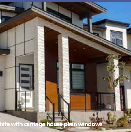
White with carriage house plain windows