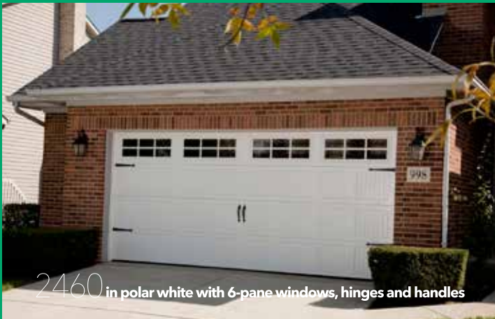
2460 in polar white with 6-pane windows, hinges and handles