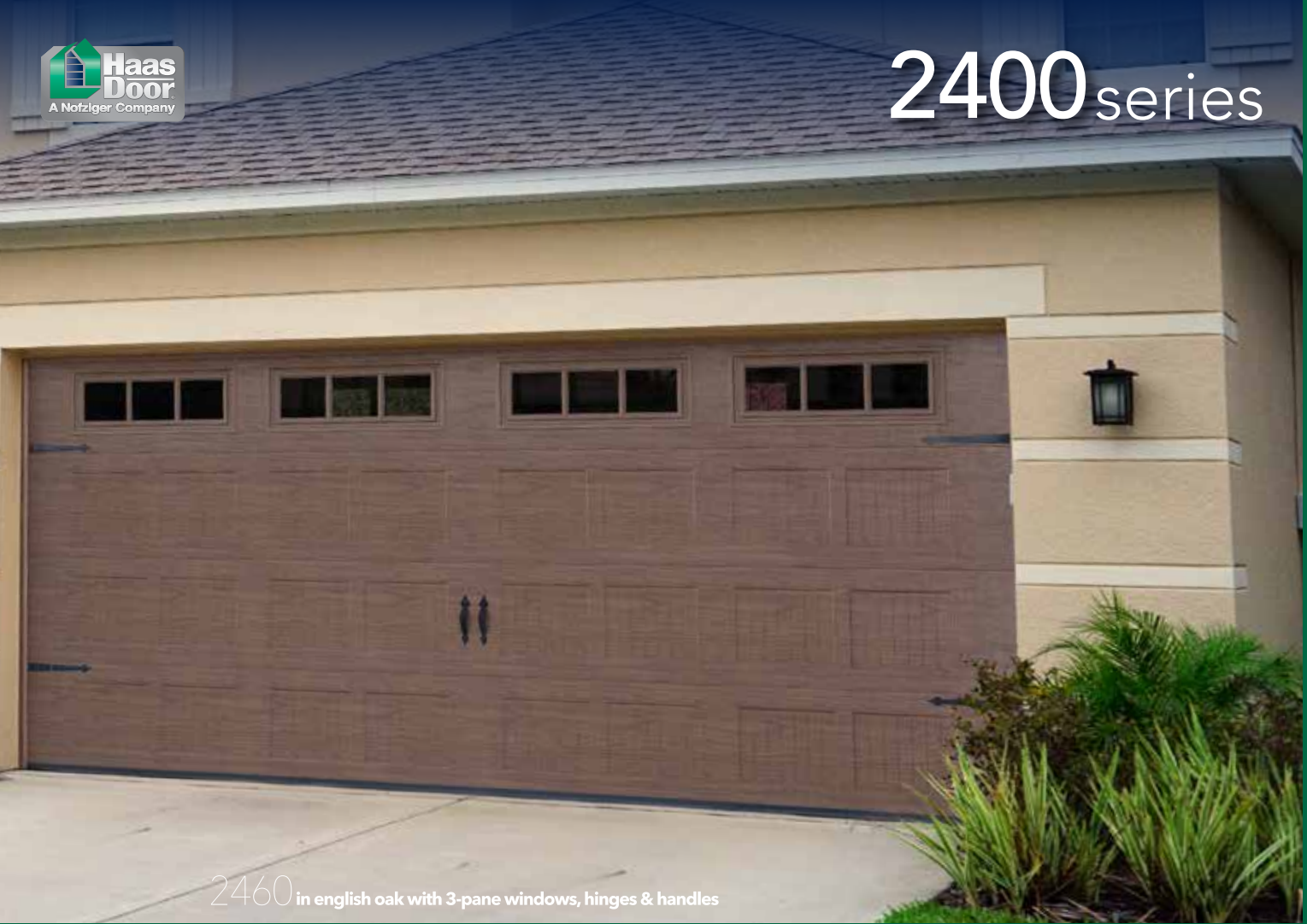
2460 in english oak with 3-pane windows, hinges & handles